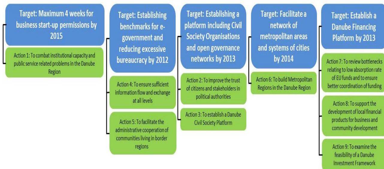
Figure 2 PA10 Targets & Actions

As reported last year, two targets for PA10 in the EUSDR Action Plan could be reached: (1) Maximum 4 weeks for business start-up permissions by 2015, and (2) Establishing benchmarks for e-government and reducing excessive bureaucracy by 2012.