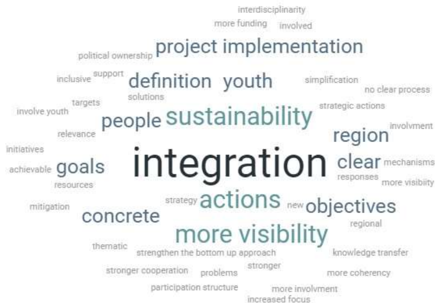
Fig. 2: Word cloud no.2

A total number of 49 people shared their views as regards the biggest change the new Action Plan should produce. They provided very diverse answers, with different degrees of complexity, but most of them referred to better integration, sustainability, more visibility and better actions . The exhaustive answers list is available in List 1-answers to polls (see pages 7).