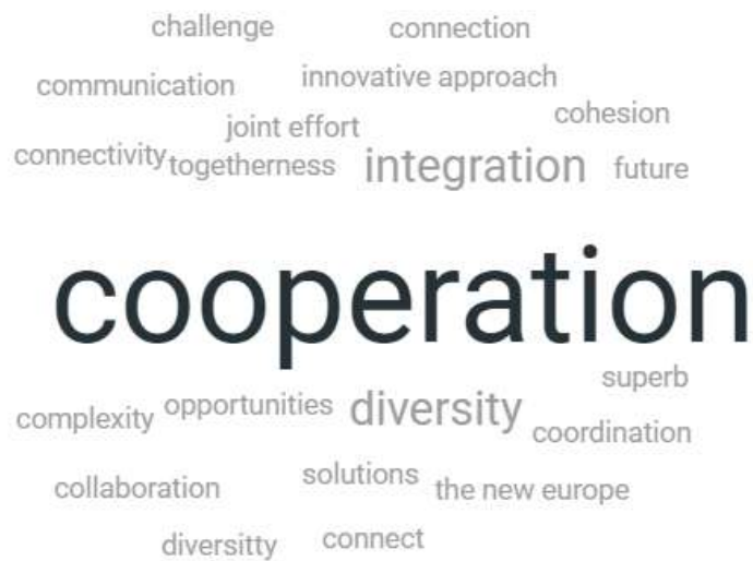
Fig. 1: Word cloud no. 1

36 participants voted for the first poll, out of which 12 identified the cooperation as the expression to describe the EUSDR. Other terms indicated by the participants were diversity (4 answers), integration (3 answers), connectivity/connect/connection (3 answers), coordination , communication , cohesion , challenge , complexity , New Europe , collaboration , togetherness , solutions , joint effort , opportunities , future , innovative approach . The exhaustive answers list is available in List 1-answers to polls (see page 8).