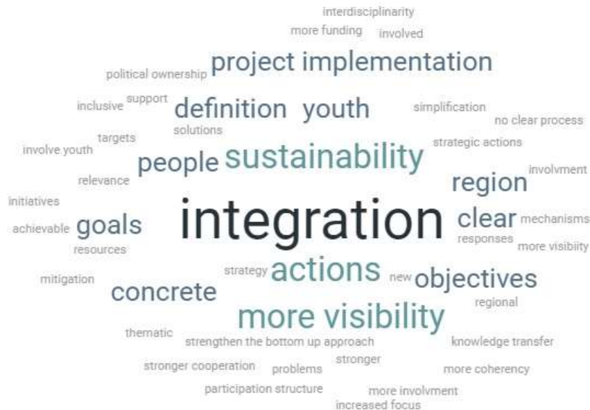
Fig. 2: Word cloud no.2

A total number of 49 people shared their views as regards the biggest change the new Action Plan should produce. They provided very diverse answers, with different degrees of complexity, but most of them referred to better integration, sustainability, more visibility and better actions . The exhaustive answers list is available in List 1-answers to polls (see pages 7).